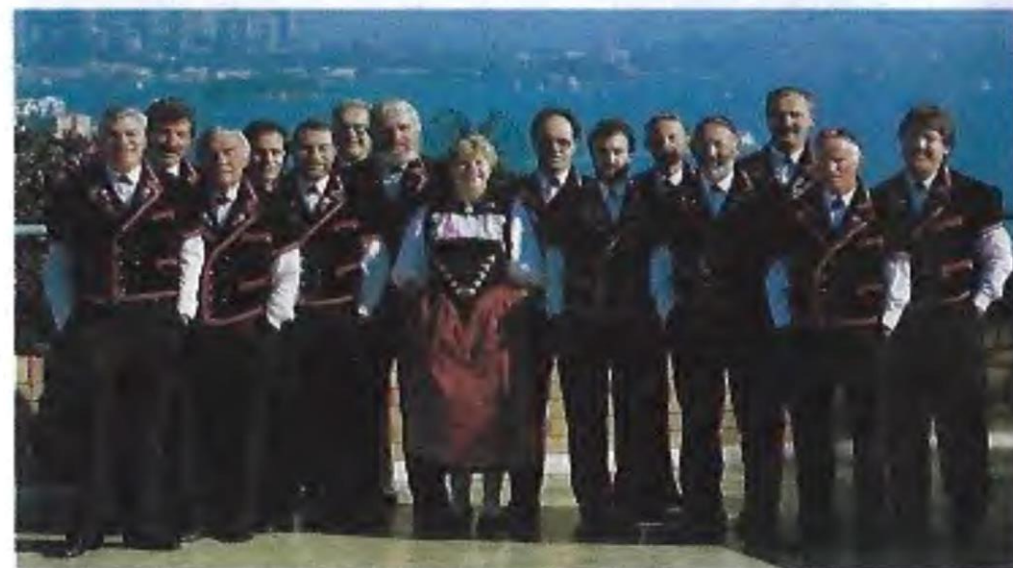
The Swiss Yodellers of Sydney. Founded in 1968 the group has a full compliment of 15 active singers, with most having been part of the group for over fifteen years.

OUTLETS AT: PONSONBY, ST LUKES, TAKAPUNA & GLENFIELD