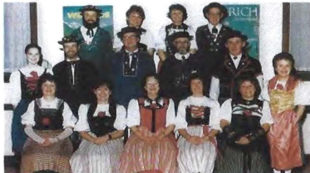
The Swiss Folk Dance Group (Melbourne) celebrated their 45th Anniversary in July 1993. They have 18 dancers. One of them joined the group in the foundation year 1948!

For reservations phone 415-6442 Riverhead-Coatesville Highway